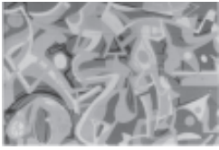
Bethel, Connecticut, 1993 (Legal Wall)