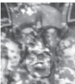
Kingston, New York, 3008 (brown field)