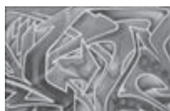
New Haven, Connecticut, 2007 (Legal Wall)

Dates indicate when I photographed these pieces, not when they were painted.