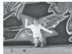
New Haven, Connecticut 2007 (Legal Wall)