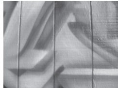
New Haven, Connecticut, 2007 (Legal Wall)