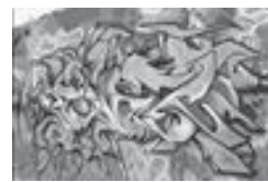
Kingston, New York, 3008 (brown field)