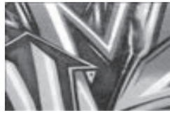
New Haven, Connecticut, 2007 (Legal Wall)