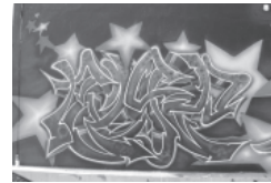
New Haven, Connecticut, 2007 (Legal Wall)