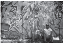
Bridgeport, Connecticut, 1993 (Legal Hoarding)