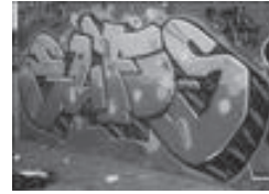
Michigan, 2008