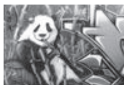
New Haven, Connecticut, 2007 (Legal Wall)