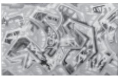
Bethel, Connecticut, 1993 (Legal Wall)