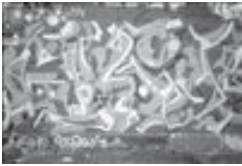
Bethel, Connecticut, 1993 (Legal Wall)