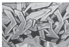
Danbury, Connecticut, 2007