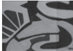
Aix in Provence, France, 2003