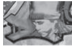
Poland, 2008, (Julie Riso, photographer)