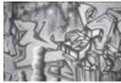
Bethel, Connecticut, 1993 (Legal Wall)