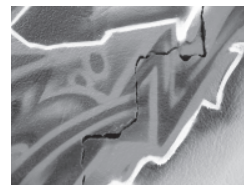
New Haven, Connecticut, 2007 (Legal Wall)