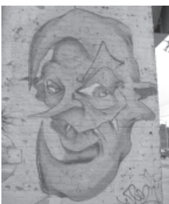
Waterbury, Connecticut, 2008