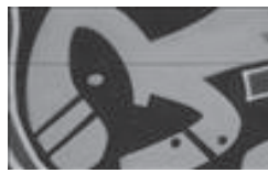
Aix in Provence, France, 2003